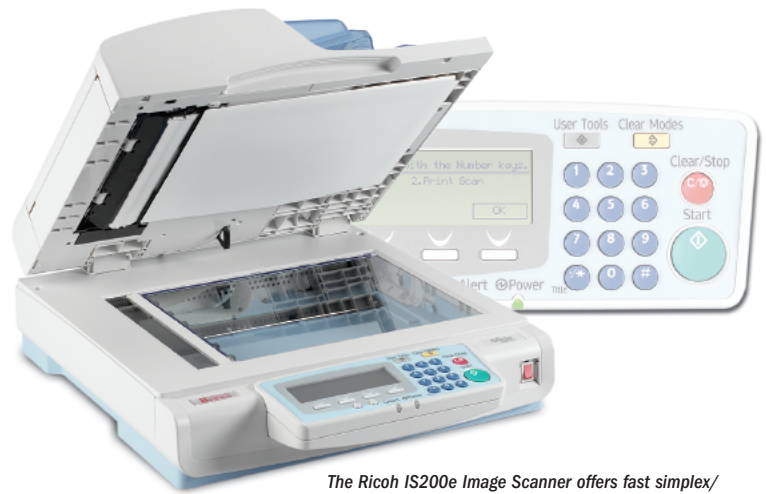
The Ricoh IS200e Image Scanner offers fast simplex/duplex black & white and color scan speeds, extensive "Scan-to" capabilities and advanced security.

The innovative Ricoh IS200e Image Scanner delivers new synergies in job operations that increase office productivity and affordability. Impressive full-color and black & white scan speeds of 34-pages-per-minute and 17-pages-per-minute respectively, mean the IS200e can easily satisfy the capture, distribution, and processing needs of your busy workgroups. For general office and light production scanning , the flexible IS200e is engineered to address the varied needs of today's technology-driven workplace.